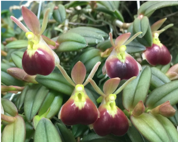
Epi. porpax 'Big Beetle' AM/AOS

2018-19 CSA San Marino Judging Center Schedule Judging Cymbidiums, Paphiopedilums, Phragmipediums Huntington Botanical Gardens Mishler Resource Building 1151 Oxford Road, San Marino, CA 91108 12:30pm Registration 1:00pm Judging Next sessions are: No Judging Jan, Feb 9, No Judging March, April 13, May 11, Summer Break, Aug 10, Sept. 14, Oct 12, Nov. 9, Dec 14