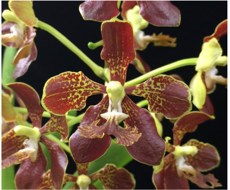
Vanda roeblingiana 'Burning Bush' AM/AOS